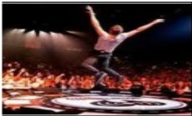
Media & Entertainment