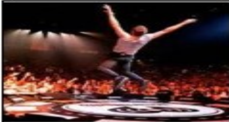
Media & Entertainment