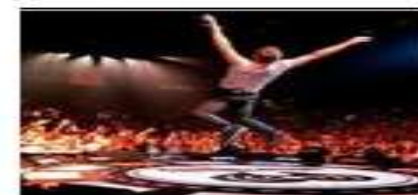
Media & Entertainment